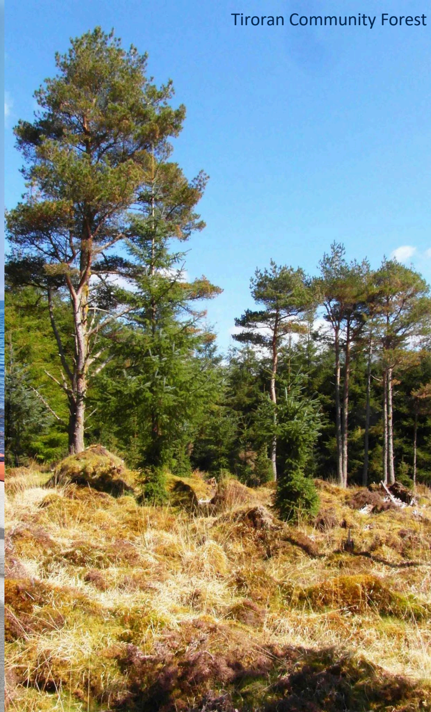
Tiroran Community Forest